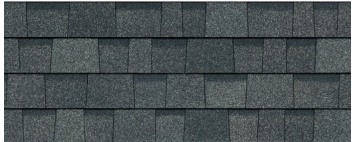
Estate Gray 1