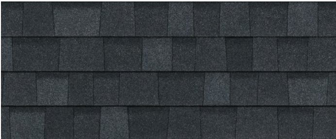
Onyx Black 1