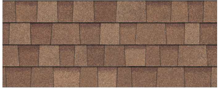
Desert Tan 1